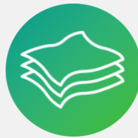
Soiled Napkins & Tissues