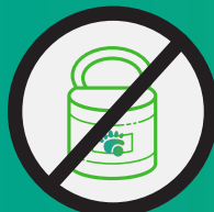
Metal & Tin Cans