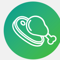
Raw & Cooked Meats