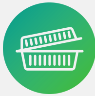
Compostable Food Containers